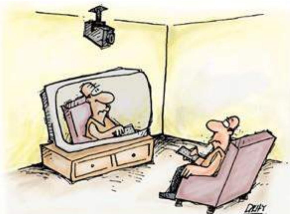
Absolute Reality TV.